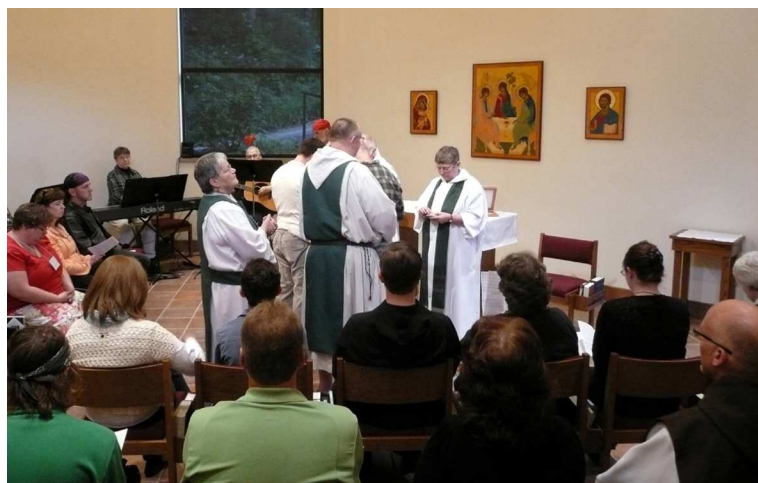
Worship during the NAECC gathering