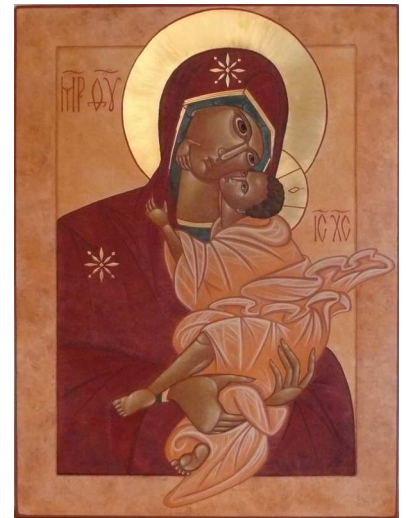
Icon: Mother of Tenderness