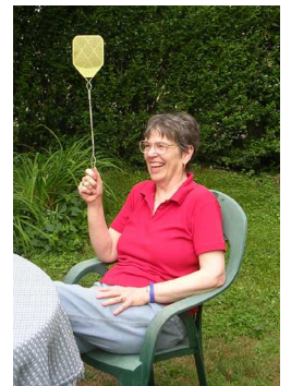
Swatter queen, defending the Labor Day pizzas