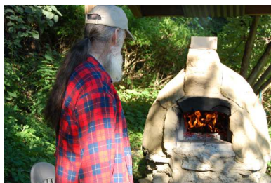
The last pizza meal of the summer