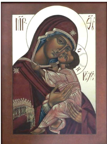
Mother of Tenderness

My ultimate gratification happens when an icon is received and blessed by the Community and is seen by all as a window into the kingdom of God. James, SCC