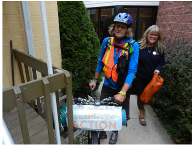
Tired after a long day on the road