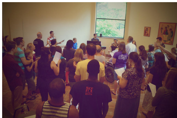
Night of Worship