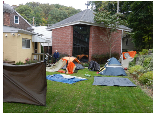
Drying out tents

In early October, Celebration was pleased to offer overnight hospitality for some fifty walkers on their way to Washington to call attention to the seriousness of climate change.