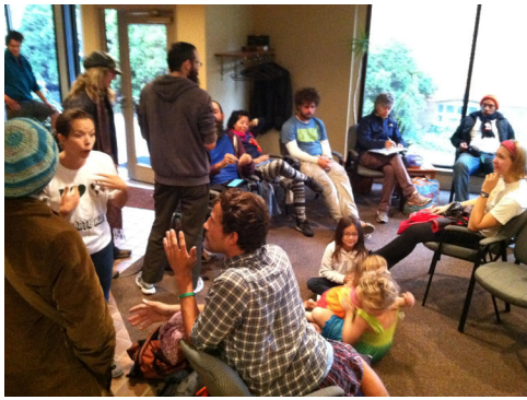
Fellowship in the gathering space

Climate Action March March 1 - November 1, 2014 Los Angeles to Washington, D.C.