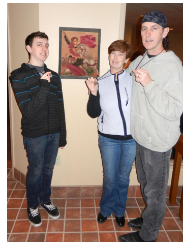
Showing off their new Companion medallions