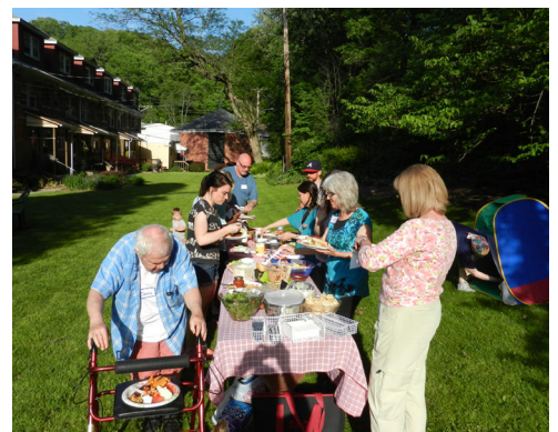
Memorial Day picnic