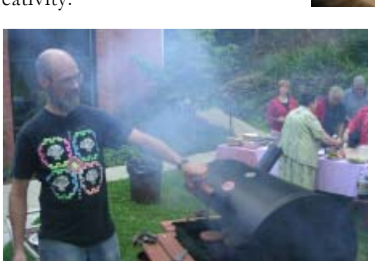
Chef / Caterer