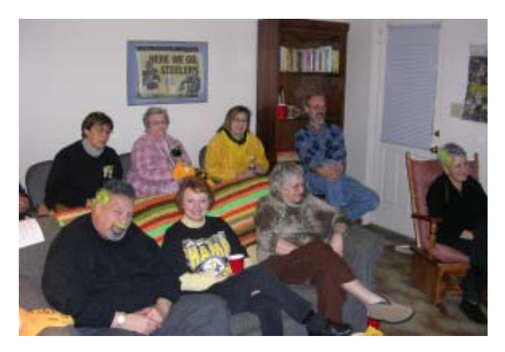
Superbowl fever on Franklin Avenue: Yes, some FAN-atics even colored their hair Steelers' black and gold.